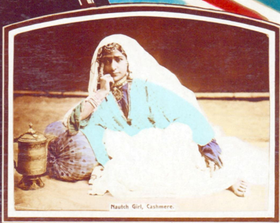
Nautch Girl, Cashmere.