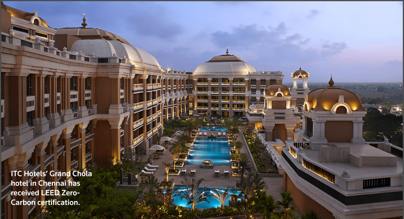
ITC Hotels' Grand Chola hotel in Chennai has received LEED Zero-Carbon certification.

THE HOTEL SECTOR accounts for around 1% of global carbon emissions, with onsite energy use being the biggest single reason for the sector's contribution to climate change.