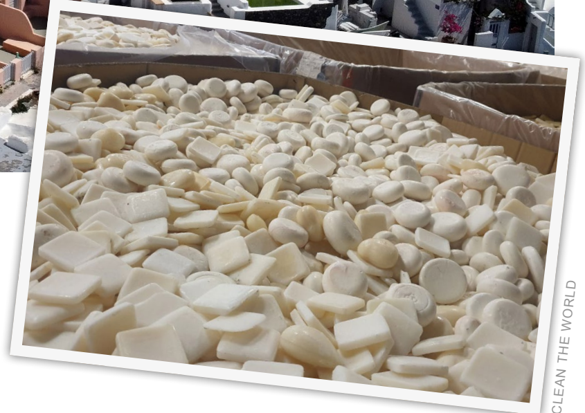
CLEAN THE WORLD

Smaller, often family-run hotels, are lagging behind in terms of sustainability. Inset: Clean the World charity recycles some of the estimated 3.3 million bars of soap used in hotels every day.