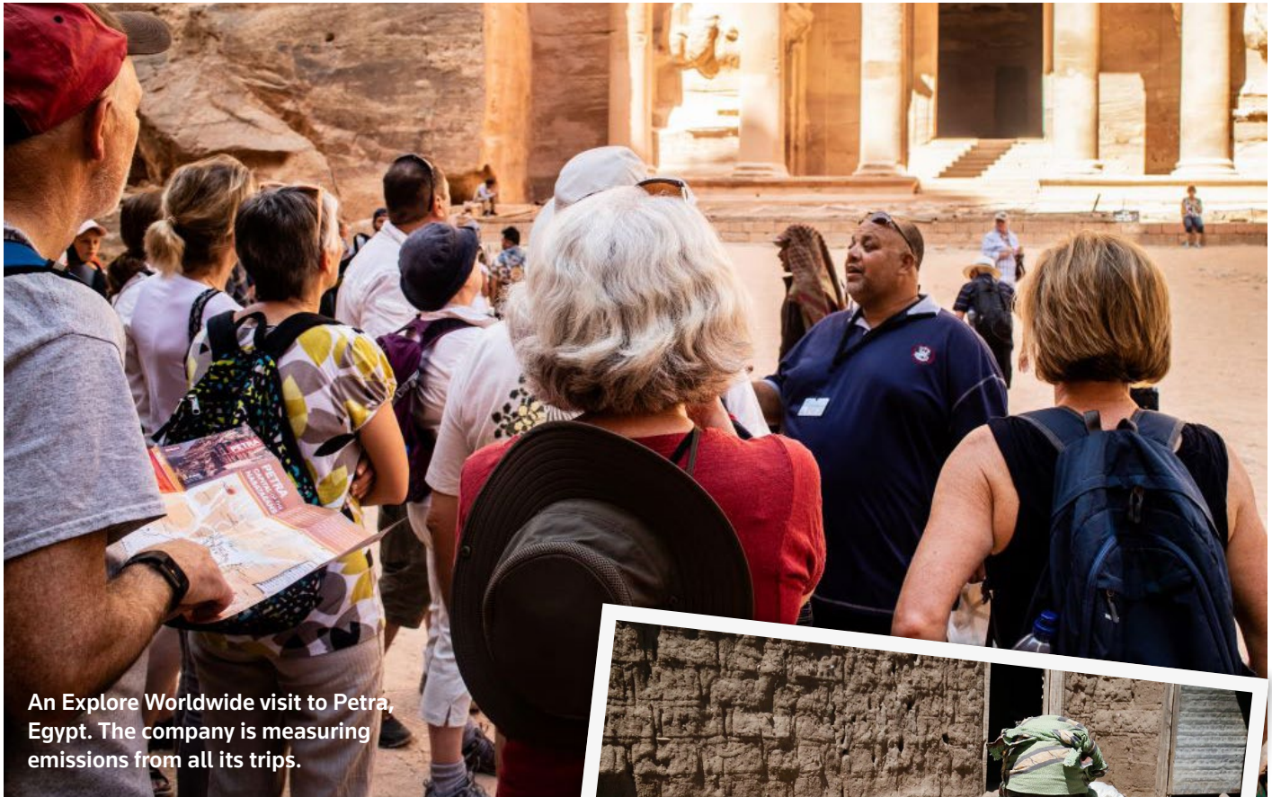
An Explore Worldwide visit to Petra, Egypt. The company is measuring emissions from all its trips.