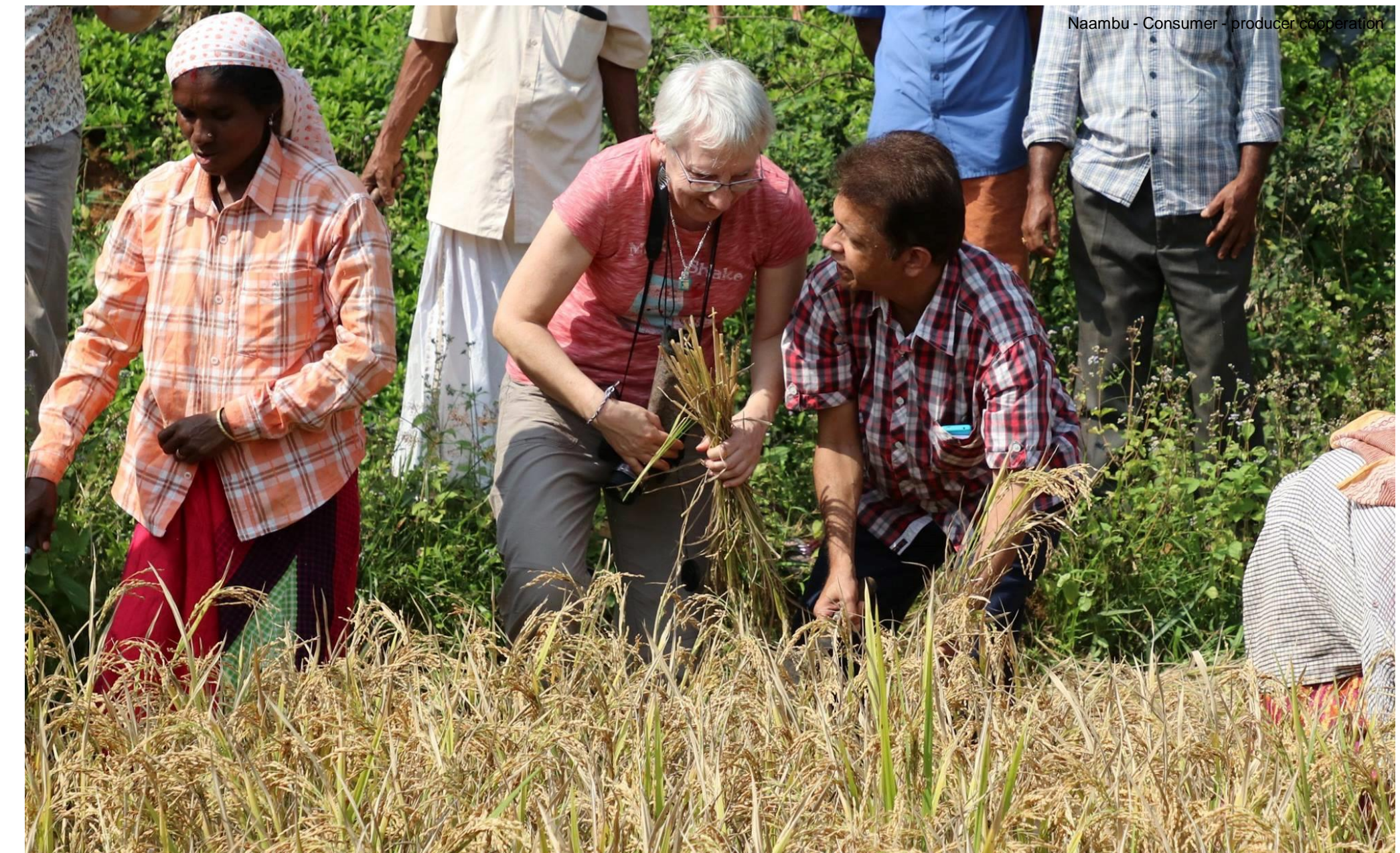
Harvet in village