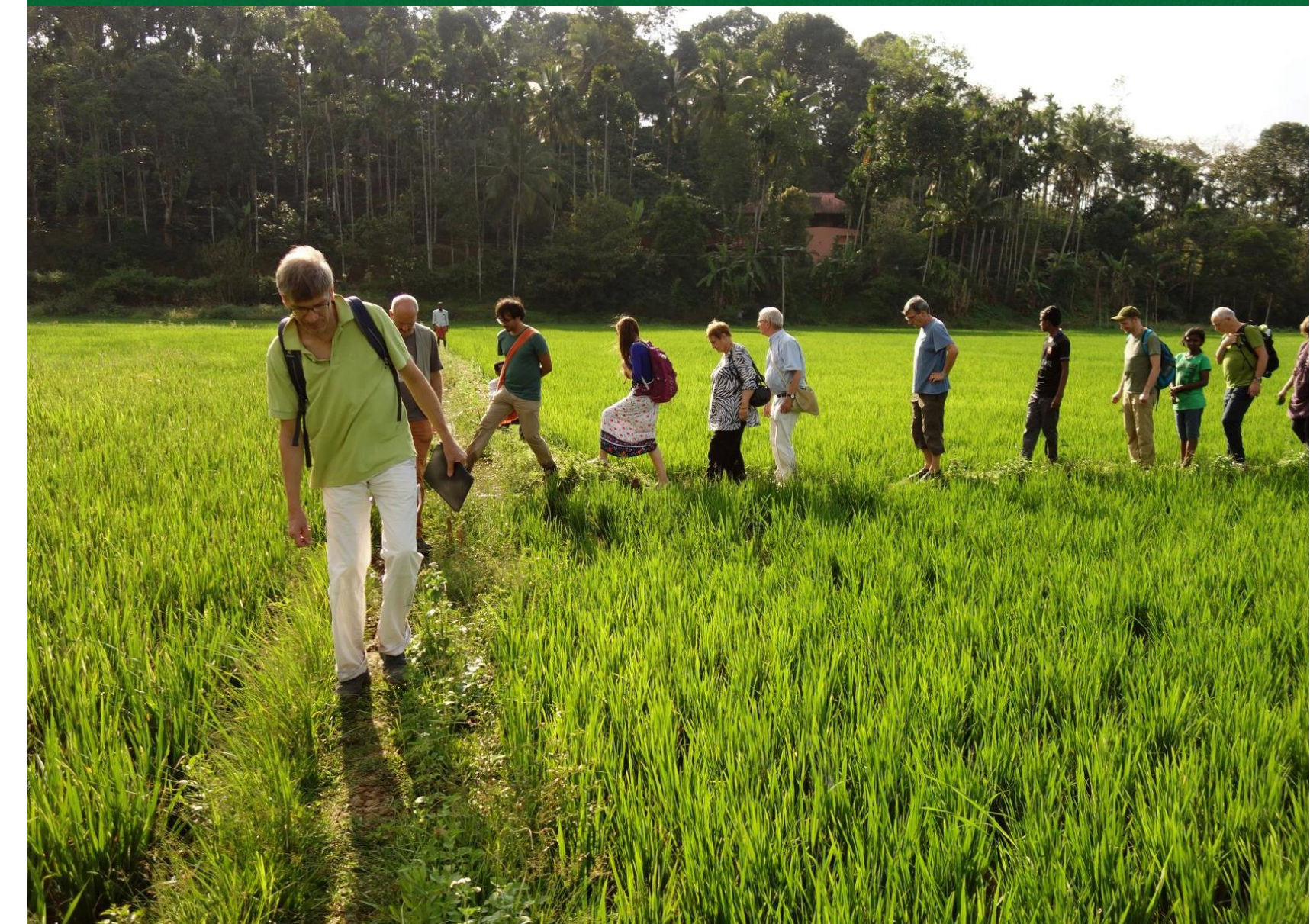
Travellers visiting the project